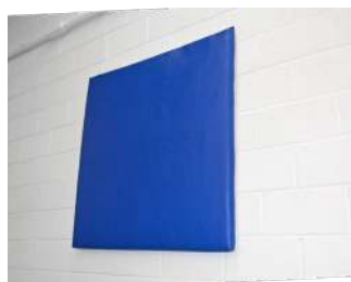
Flat Wall Baffle