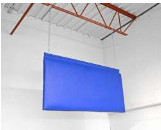
Free Hanging Baffle

Pro Tip: Acoustic baffles can be used as standalone products, or in conjunction with other AmCraft acoustic curtain products in order to boost the sound absorption and overall noise reduction experienced in a given space.